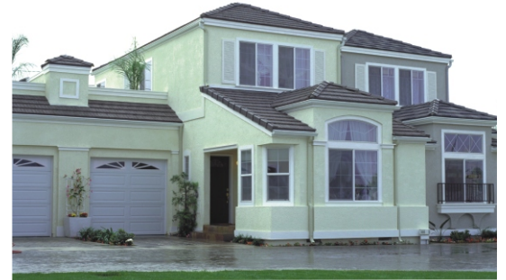
OPTIONAL KITCHEN WINDOW Shown with Tile and Stucco

Approx. 543 SQ. FT. SECOND FLOOR Approx. 744 SQ. FT. FIRST FLOOR 1287 Sq. Ft. TOTAL